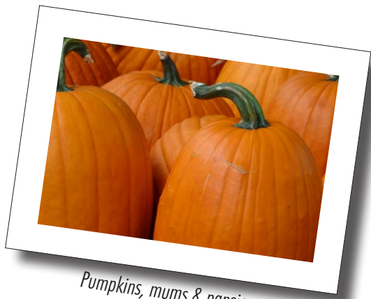
Pumpkins, mums & pansies are coming!